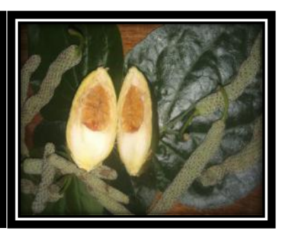
Piper betel (Gawed)