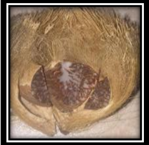
Areca nut (Buwa