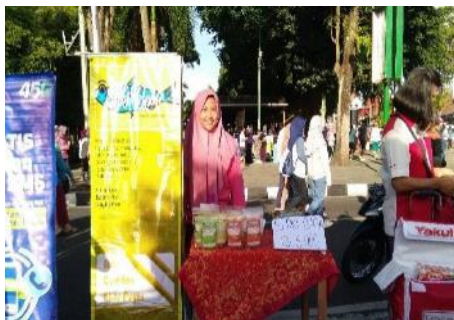
Fig.11: Sales and car-free day