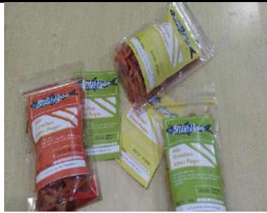
Fig.6: Product Label Stick Already Given