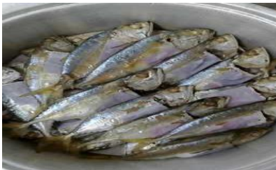
Fig.1: Sardine Already Presto