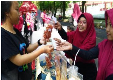
Fig.10: Sales Events Bazar

Sales stand was also opened at bazar and car-free-day events to increase sales and gain many consumers.