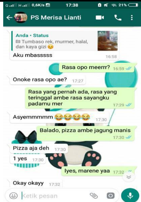
Fig.8: WhatsApp of Basa Sardine Sticks

Sales by using social media and accounts, such as Instagram, serve to provide information relating to the products offered. The information shows the advantages of the product. It aims to attract consumers' interest to increase product sales. The various information and consumers' comments are attached onto the product package to encourage the sellers and the buyers in improving the products as well as satisfactory services.