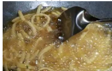
Fig.4: Stick Frying Process