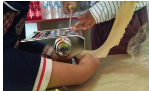
Fig.3: Grinding the batter