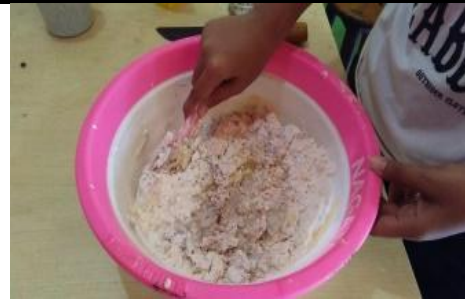
Fig.2: The batter is well-blended