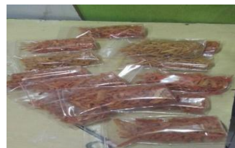
Fig.5: Packaging session